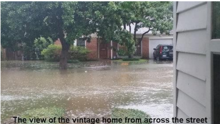
The view of the vintage home from across the street

As Ron and Bev slept the night away, the rain and winds came. The heavy rains that we witnessed in the comfort of our living room on television fell constantly overnight. The neighborhood streets began to overflow with water and flood.